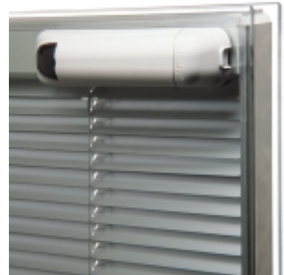
external motor activation