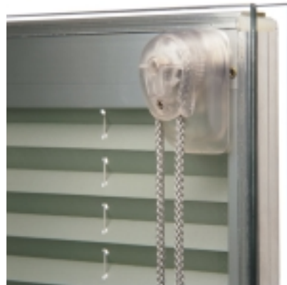
cord-loop on continuous blind