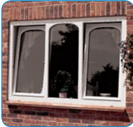
tilt & turn

AC Yule's exciting new Kapcell range encompasses a large range of PVCu windows and doors : casement, tilt & turn, fully reversible and vertical slider windows, along with residential, french, patio and bi-fold doors.